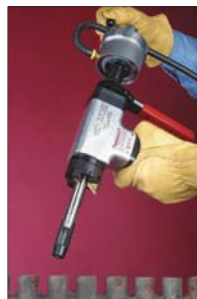
The Air Clamp Mongoose instantly clamps and releases the tool from the tube or pipe i.d. This simple innovation is easy to use, increases production, and minimizes operator fatigue by eliminating the tedious and time consuming task of manual clamping.