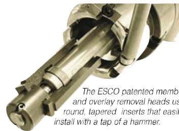
The ESCO patented membrane and overlay removal heads use round, tapered inserts that easily install with a tap of a hammer.