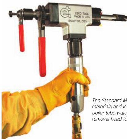
The Standard Mongoose is ideal for end prepping all boiler tube materials and is only 2.25" wide for accessing single tubes in a boiler tube waterwall. It can also be equipped with a membrane removal head for removing membrane from boiler tubes.